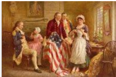
Betsy Ross 1777