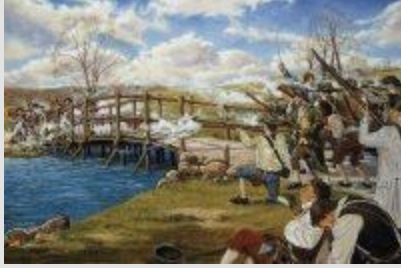
The Shot Heard 'Round the World