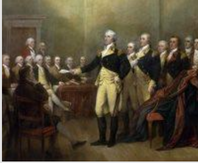
General George Washington Resigning His Commission