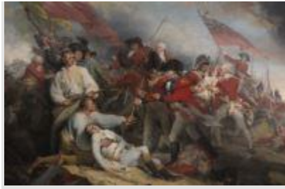
The Battle of Bunker's Hill, June 17, 1775