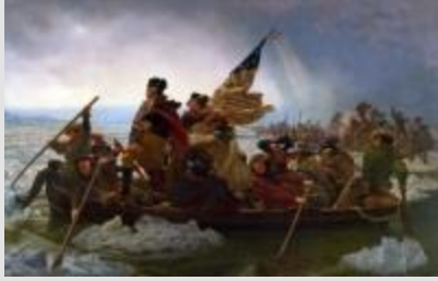
Washington Crossing the Delaware