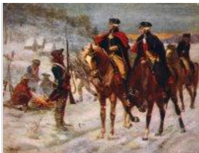
George Washington and Lafayette at Valley Forge

by John Ward Dunsmore by Thomas Buchanan Read