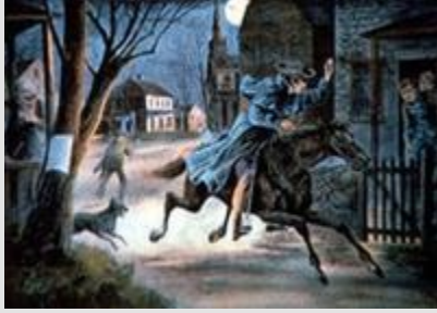
Paul Revere's Midnight Ride

by Henry Wadsworth Longfellow. Paul Revere's heroic actions in the cause of American freedom were immortalized in this poem which recounts the story Paul Revere's midnight ride of April 18-19, 1775 to warn the Massachusetts countryside of the coming British invasion.